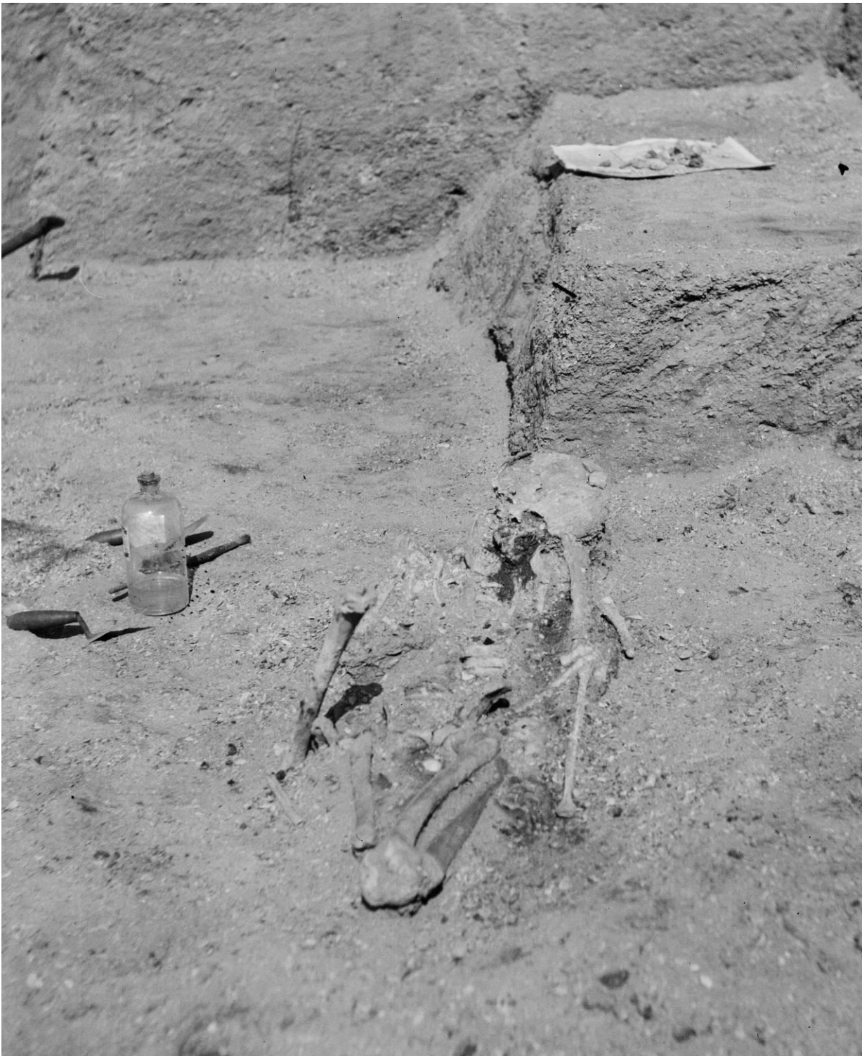
Figure 2: Arruda 6 at the time of excavation.

The sample we dated was a fragment of a right fibula (Figure 1), confirmed as belonging to the individual numbered Arruda 6 by comparison with the left (complete) fibula of the same individual 2 . The sample was removed with permission in 2013 with a fine saw from the proximal end of the surviving shaft section. The laboratory report includes the information that the C/N ratio is 3.3, the collagen %C is 39.3 and the %N is 13.8: the results are highly reliable.