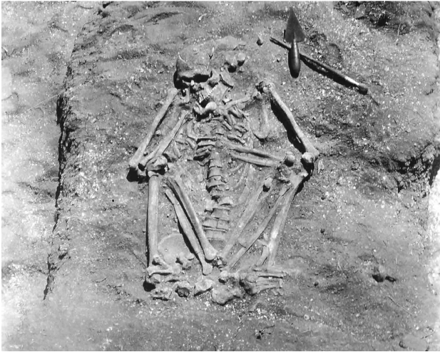
Figure 5. Amoreira Skeleton 6, excavated and photographed August 1933. Cropped from the scan of a photographic print incorrectly labelled Muge 1930/16, at the Museu de História Natural da Universidade do Porto. An unnumbered negative exists but has deteriorated. The skeleton lies in dark anthropogenic sediments just above the basal sands. The field notes record that the flexed skeleton was 90cm long.

Of the Amoreira skeletons from the 1960s excavations for which the burial disposition can be ascertained, Skeletons 6, 7, 8 (right side), probably 12 and certainly 13 have such upper constriction. The photographs from the 1930s of those few Amoreira skeletons which were undisturbed give us certain information only for Skeleton 6: this individual was apparently buried without upper body constriction (Figure 5).